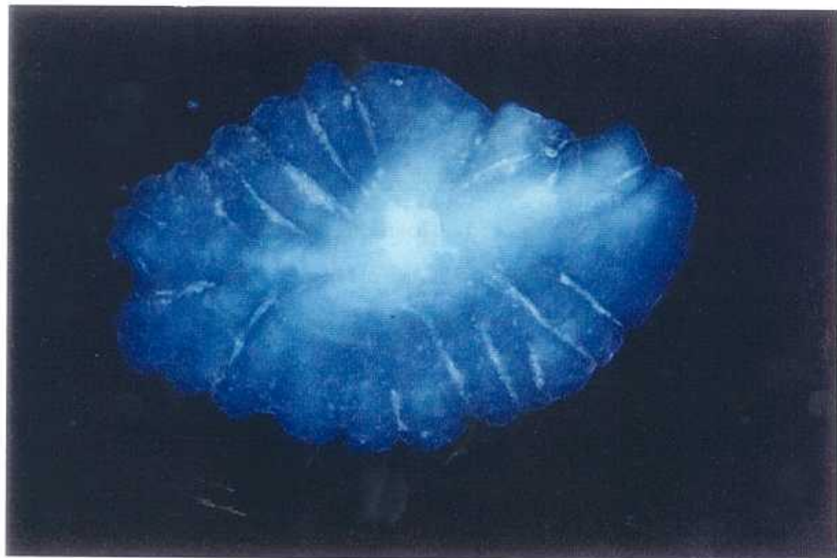
Plate 4.3 Photograph of a whole sagittal otolith from a juvenile A. butcheri (T.L. 104 mm) NB. No opaque zones are present.