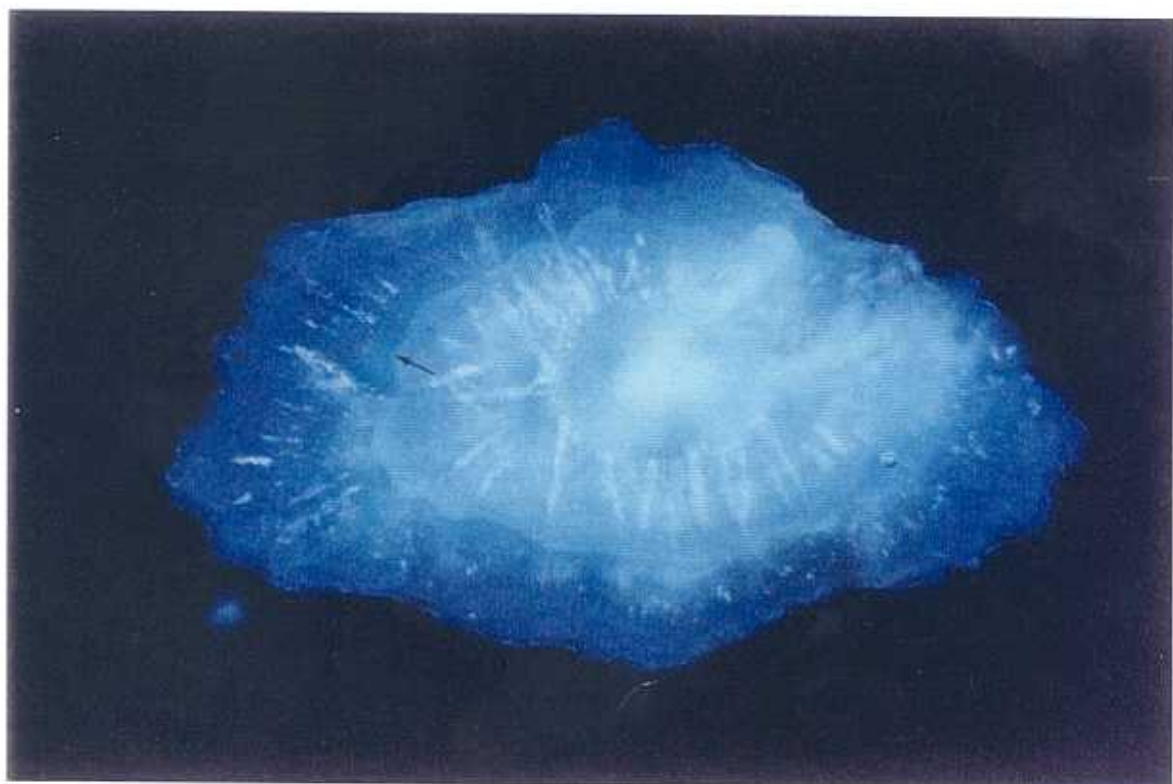
Plate 4.4 Photograph of a whole sagittal otolith of A. butcheri (T.L. 210 mm) with two opaque zones (shown by arrows).