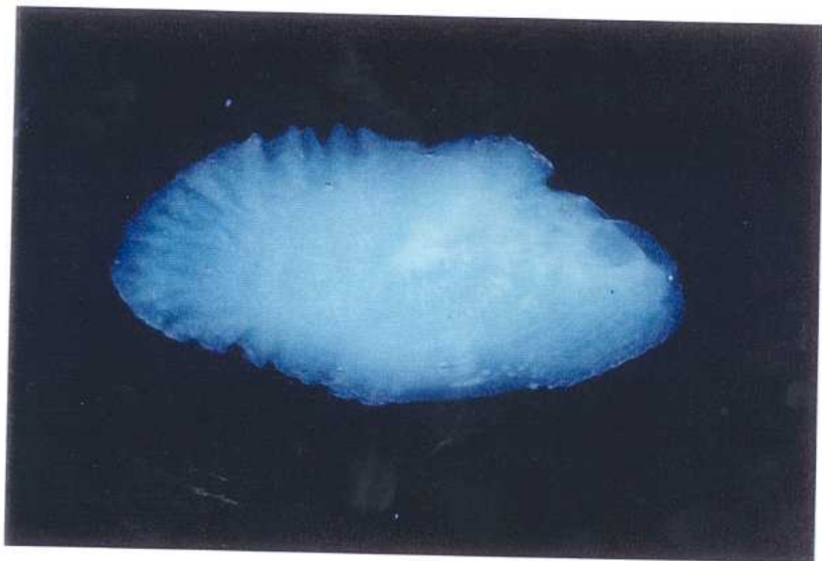
Plate 4.1 Photograph of the convex surface of a whole sagittal otolith from a large Acanthopagrus butcheri (T.L. 412 mm) NB. Opaque zones are almost indistinguishable due to the thickness of the otolith.